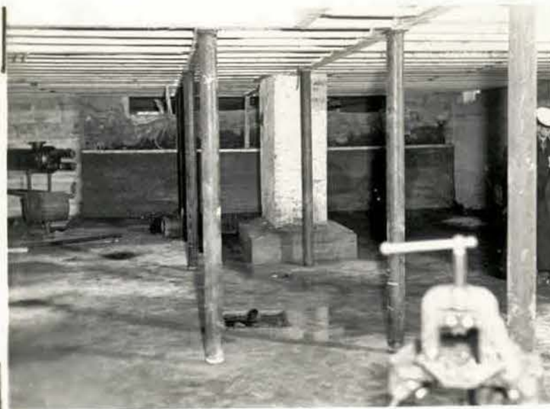
13295 L Maheux Maintenance 3-11-59 Building 51 Captain's Residence Basement.