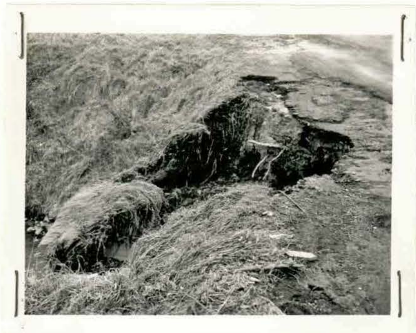
13354 L Porter Maintenance 20-11-59 Storm damage on Base and P.M.Q.