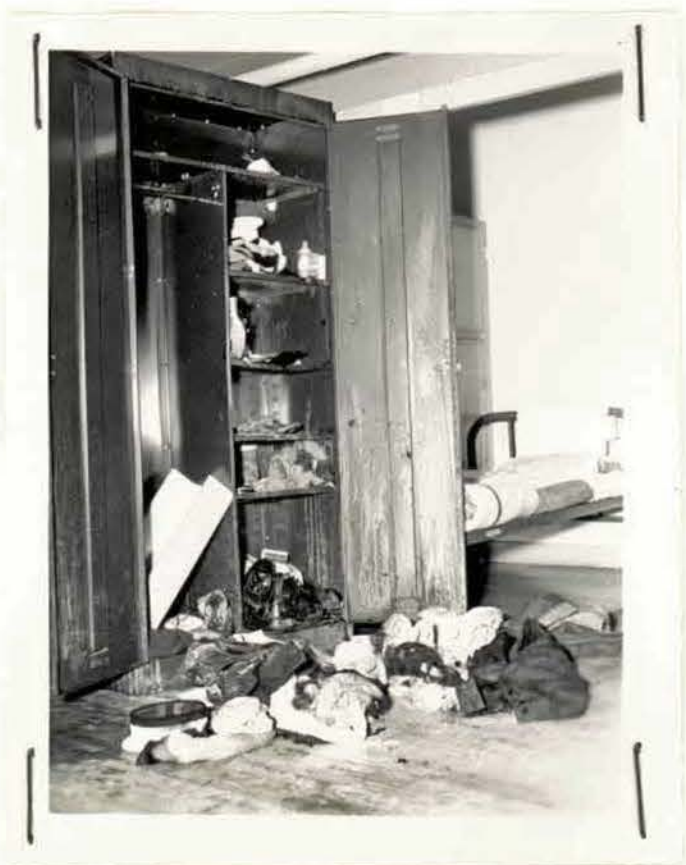
13338 L Ball Fire Department 20-11-59 Fire damage to locker in building 34-1 south.