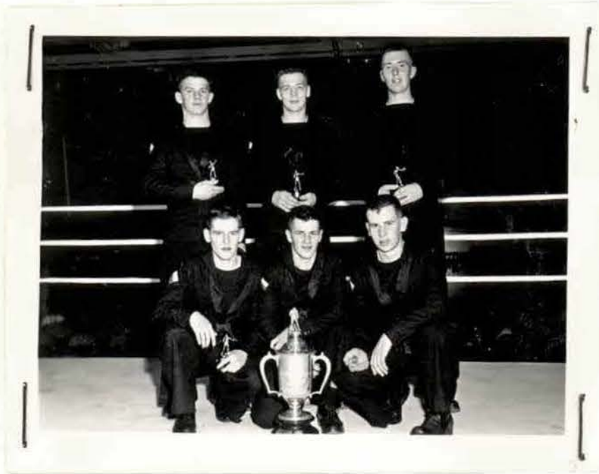
13334 L Ball P&RT School 19-11-59 Terra Nova Division - winners of inter-divisional boxing finals.