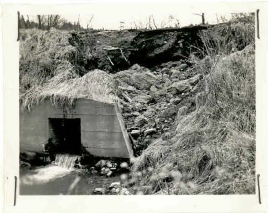
13353 L Porter Maintenance 20-11-59 Storm damage on Base and P.M.Q.