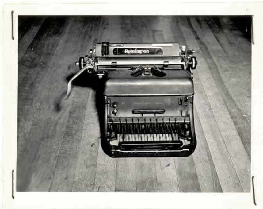
13330 L Ball Fire Department 16-11-59 Damage to typewriter, due to fire