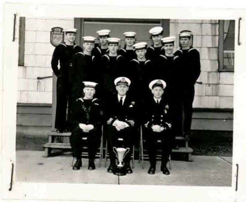
13355 H Maheux Comm. School 23-11-59 Class Photo CR131