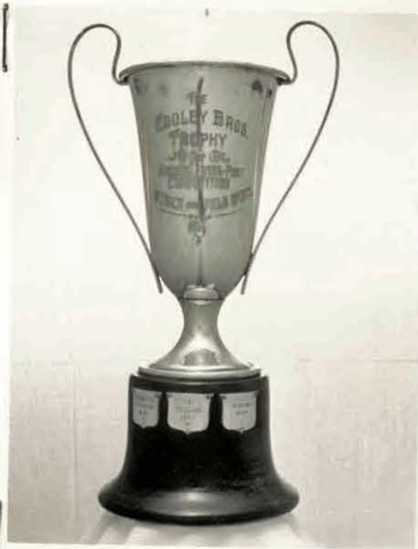
13343 L Porter P&RT School 20-11-59 Trophy Identifi- cation Photo. The Cooley Bros. Trophy.