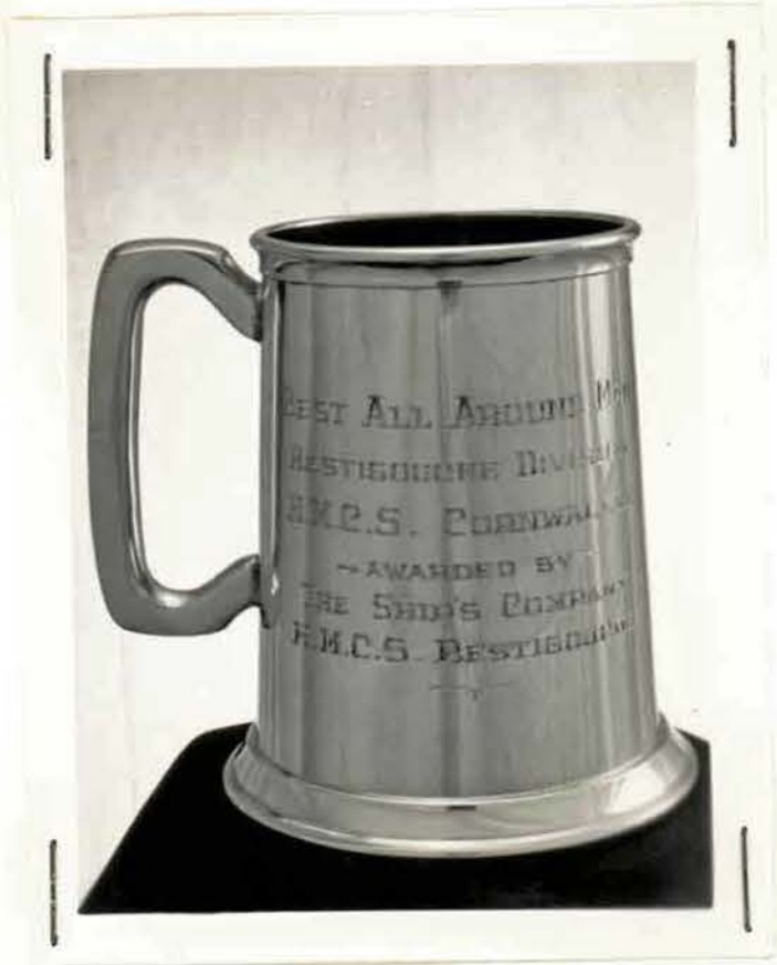
13315 L Ball N.E.T.O. 16-11-59 Silver Beer Stein to be presented to Best All Round Man in Restigouche Division