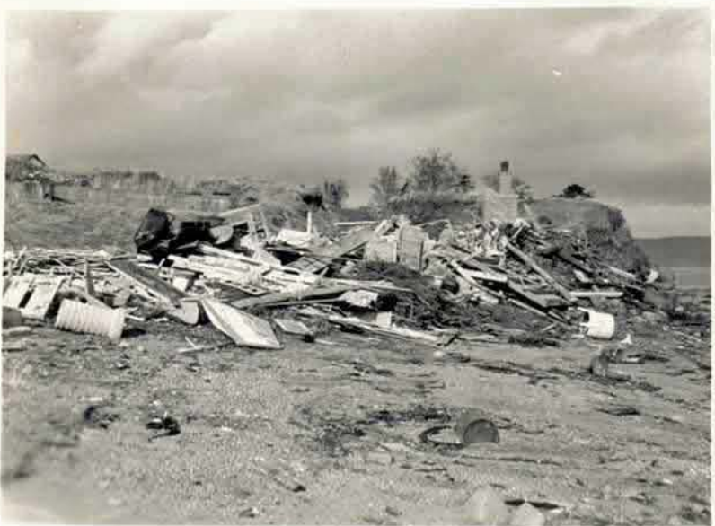
13313 L Maheux Fire Department 6-11-59 Garbage and debris accumulated on shore in front of Communications School