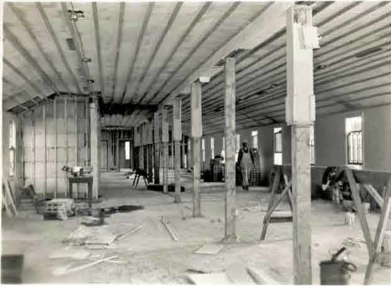
13294 L Maheux Maintenance 3-11-59 Building 34-11 Upper Deck West Wing.