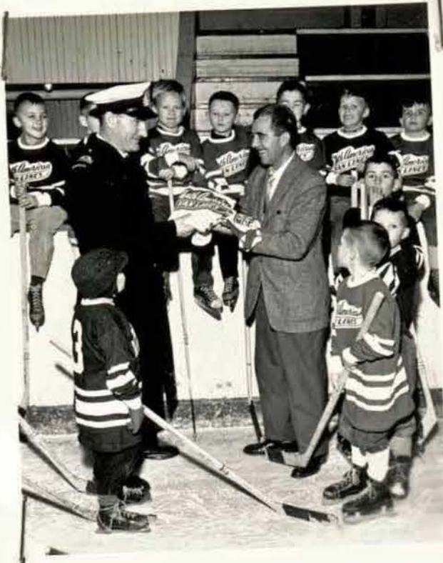
13342 L Porter Comm. School 20-11-59 Presentation o sweaters to Junior Boy's Hockey Club.