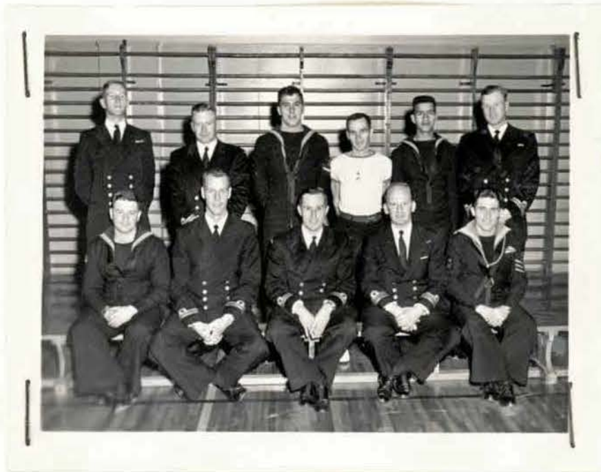
13316 L White P&RT School 13-11-59 CORNWALLIS Rugger Team - 1959.