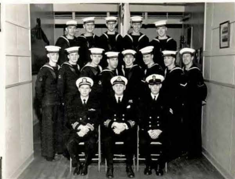
13344 H Porter Comm. School 20-11-59 Class Photo. 2R11 Comm. School