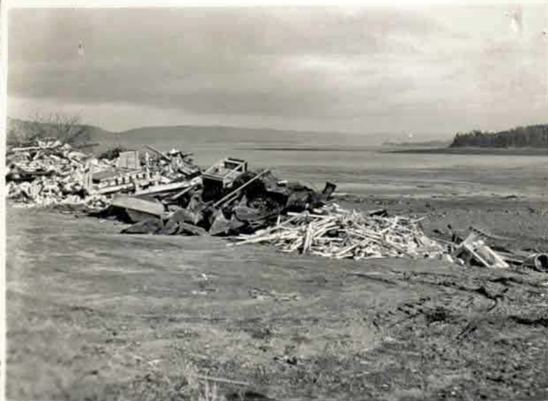
13312 L Maheux Fire Department 6-11-59 Garbage and debris accumulated on shore in front of Communications School.