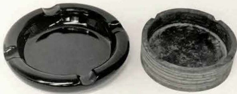
13302 L Maheux Fire Department 5-11-59 Fire hazard of wooden ash tray as compared to glass.