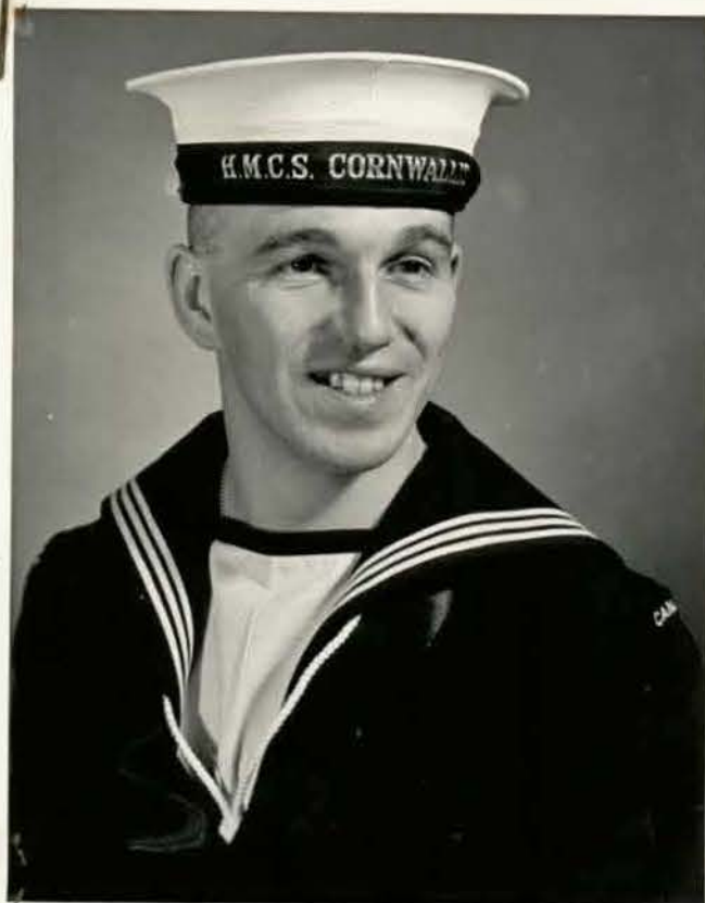
18873 HQ Estensen Training 20-4-64

ABMA Walton, 59710-H Dartmouth NS. Best all round man Terra Nova 1/64 Div.