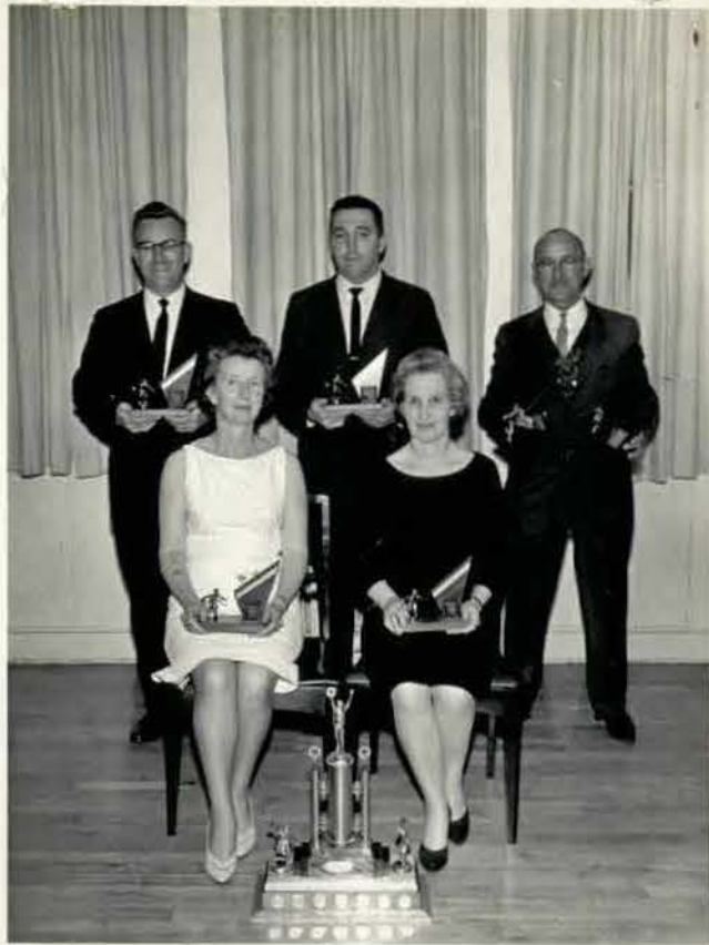
18892 L White Wardroom 22-4-64