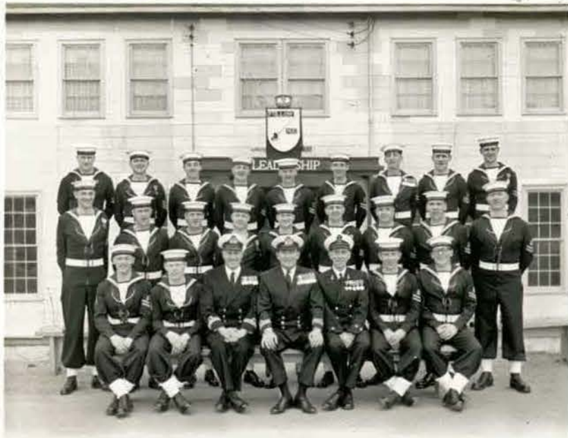
18871 L White Ldr'ship 14-4-64