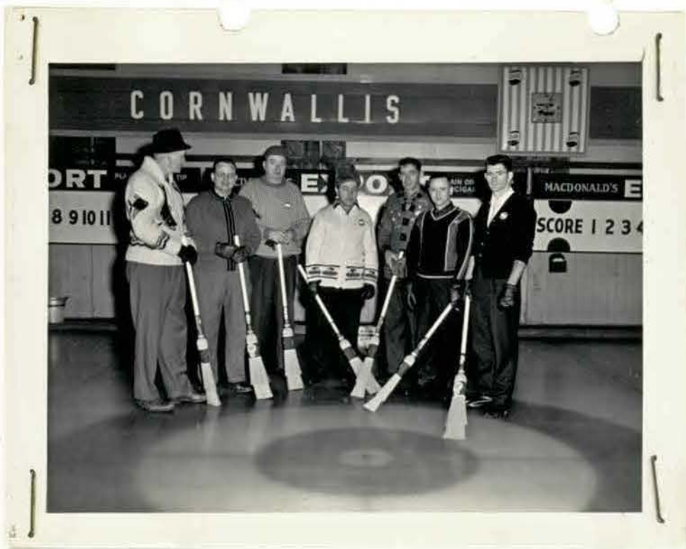
18883 L White P&RT 13-4-64

Representative from Ships in Atlantic Cmd Curling