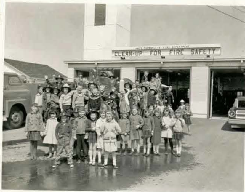
18894 L White Fire Dept 24-4-64