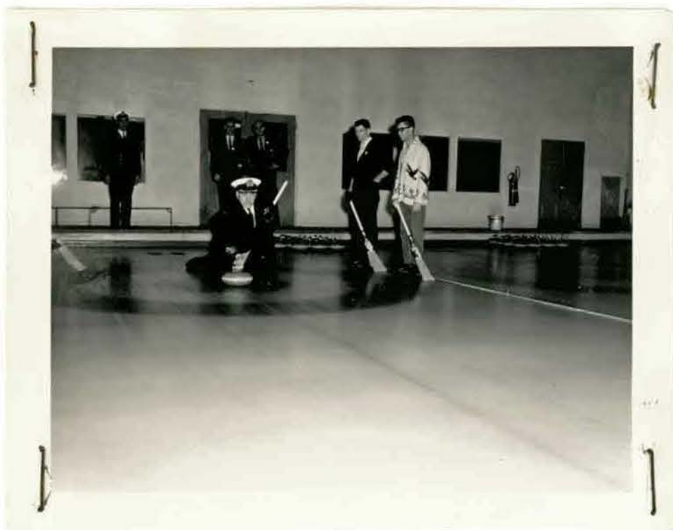
Runners-up in Atlantic Curling Championship