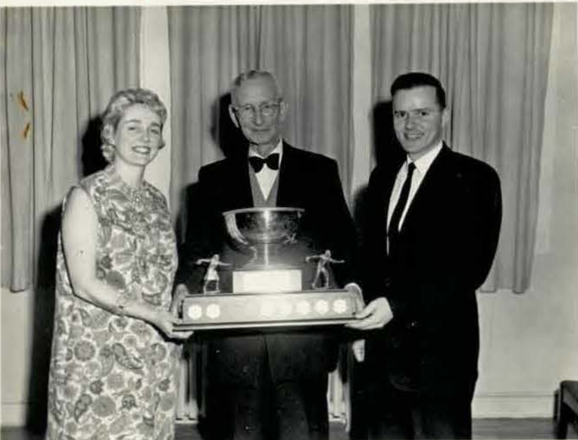
18891 1 White Wardroom 22-4-64