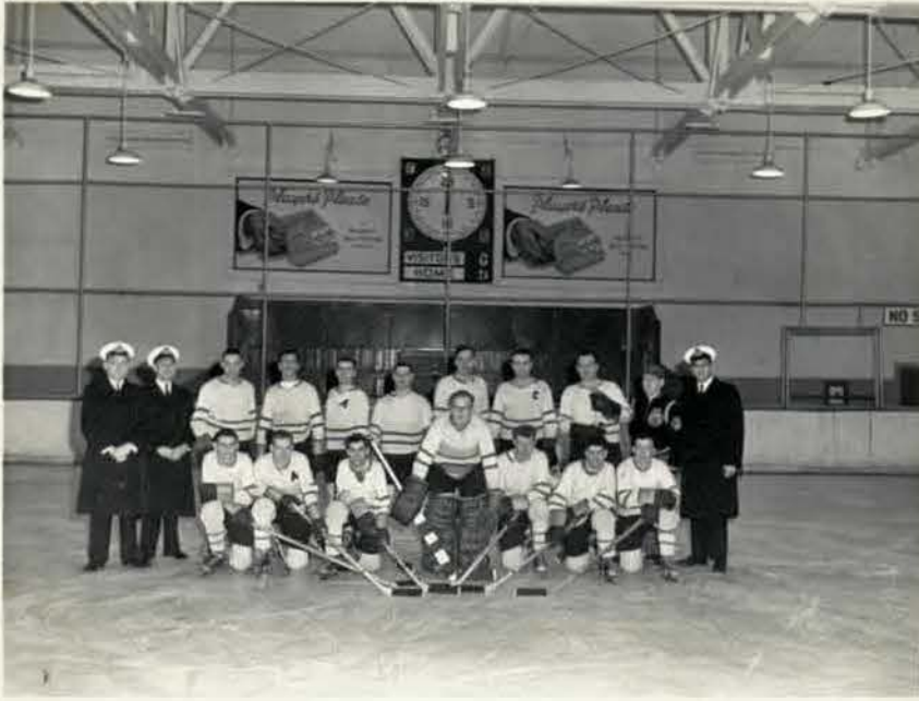
18889 L White P&RT 17-4-64