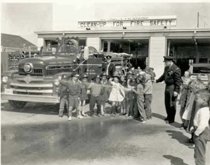
School children visit fire hall