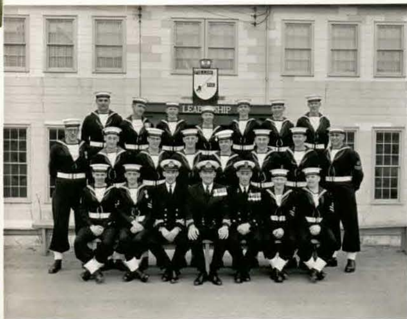
18872 L LDr'Ship 14-4-64 White