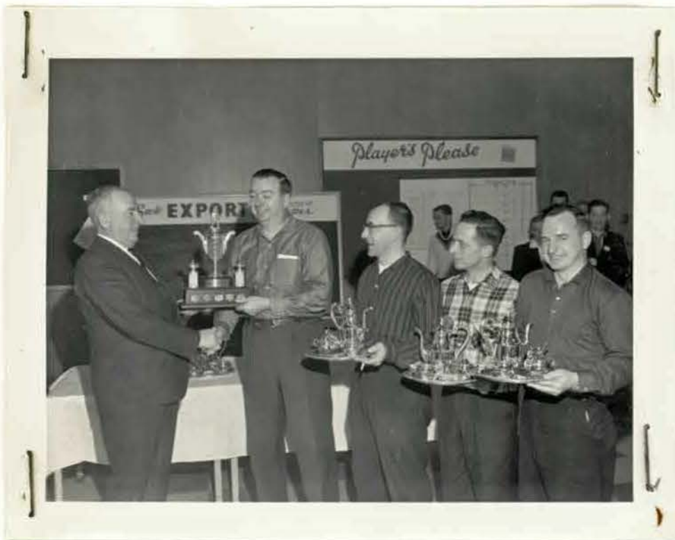
18884 L White P&RT 13-4-64

Representative from Ships in Atlantic Cmd Curling