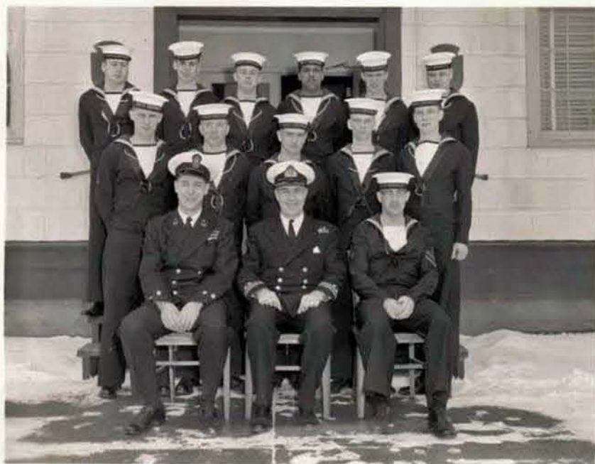
19695 X ESTENSEN COMM SCHOOL 23-3-65 RM 152 CLASS PHOTO