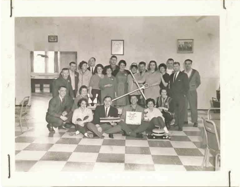
19680 X MCCLINTON C&PO MESS 803-65 REPRESENTATIVES OF C&PO'S MESS CORNWALLS WHO VISITED CAMP GAGETOWN FOR SPORTS WEEK-END