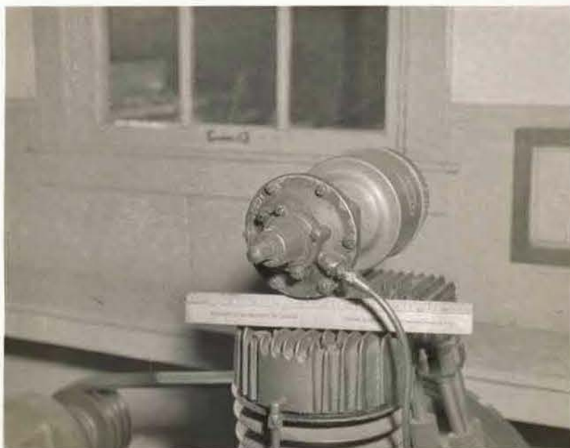
19696 X REL D NAVAL LAUNDRY 25-3-65 PRESSURE RELIEF VALVE, AIR COMPRESSOR FOR A.D. PURPOSES