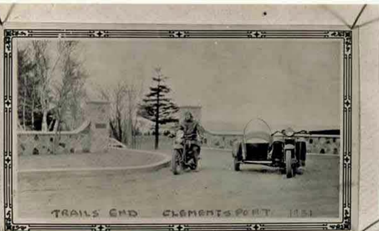
19707 X MCCLINTON