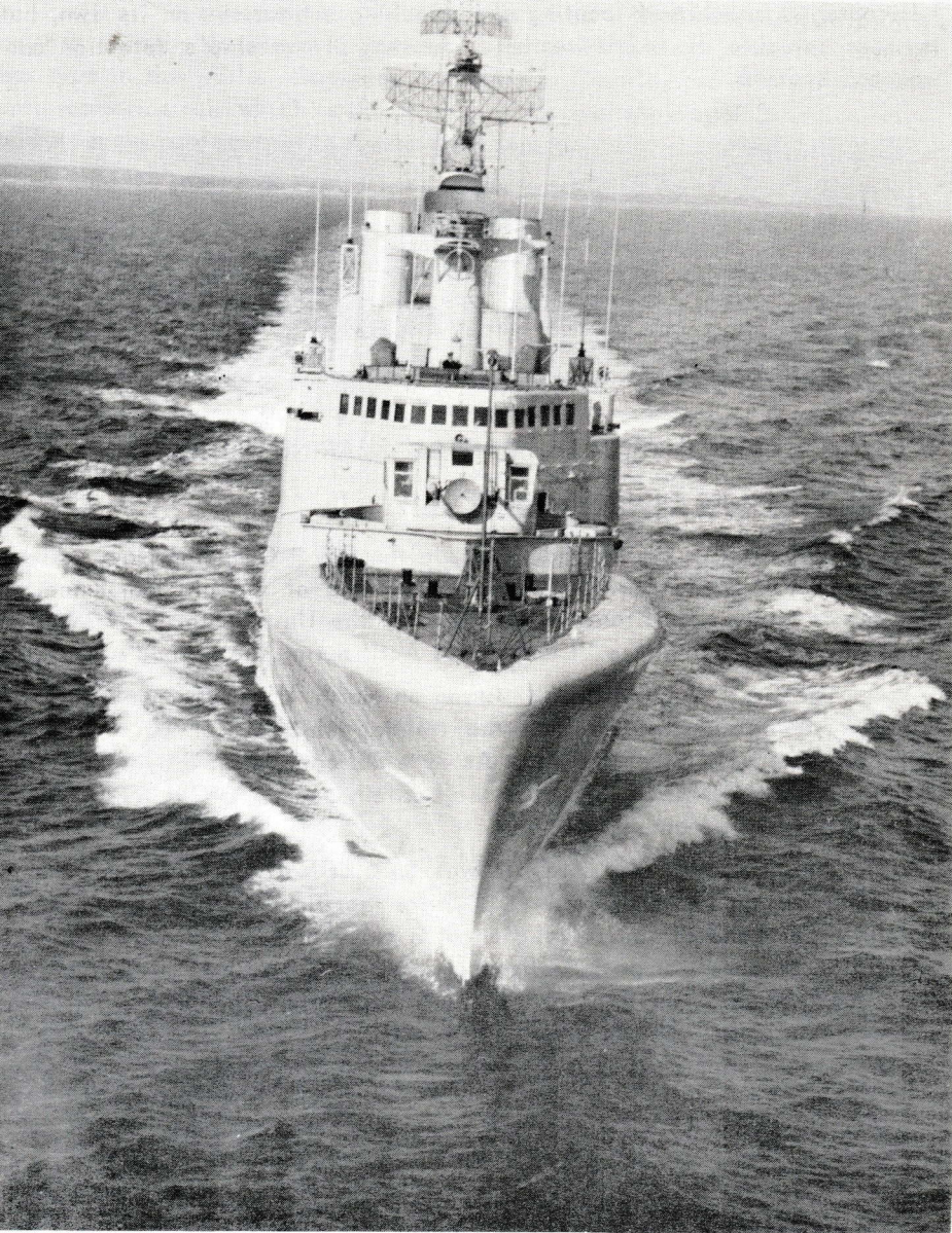
HMCS ANNAPOLIS MOVING AT HIGH SPEED