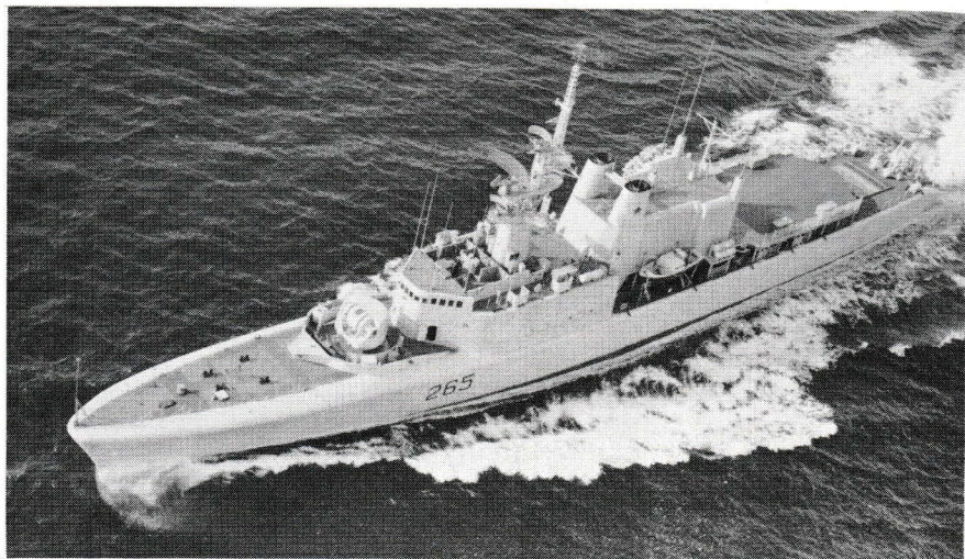
A BIRDS EYE VIEW OF HMCS ANNAPOLIS

The ship is fitted with stabilizers to reduce the roll and pitch for helicopter operations, and a pre-wetting system to wash down the ship and remove radioactive contamination in the event of nuclear warfare. The ship carries enough provisions and stores for ninety days and carries over twelve thousand different stores items. The ship makes its own fresh water – up to sixteen thousand gallons per day, and generates enough electricity to supply three hundred modern homes.