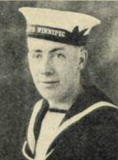
R. SARGENT 2024