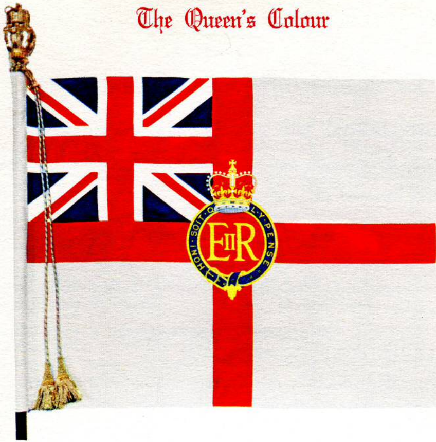
The New Colour