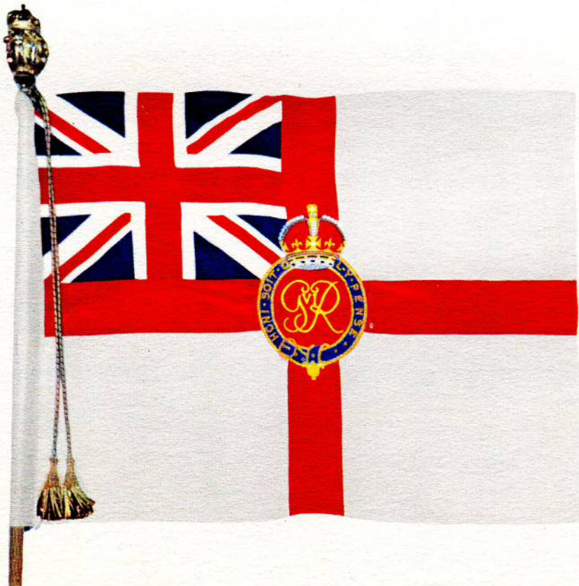
The Old Colour