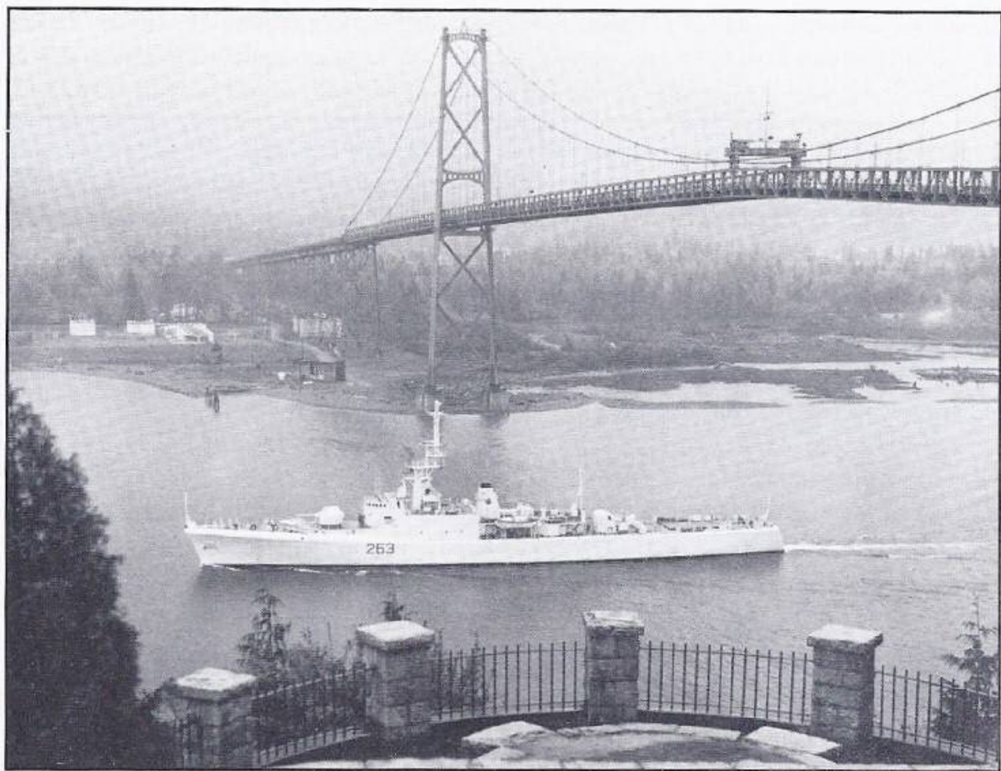
Under Vancouver's famous Lions Gate Bridge, destroyer escort hull 263 proceeds to the Strait of Georgia for last minute trials prior to joining the Canadian Anti Submarine fleet. This photo taken prior to HMCS YUKON being commissioned on 25 May 1963.