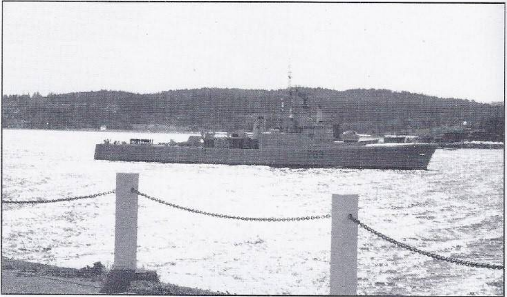
HMCS YUKON arrives in Esquimalt for the first time, Friday, 29 May 1963 at 1540. YUKON sailed from Vancouver immediately after the commissioning ceremony stopping for ammunition prior to entering Esquimalt harbour. YUKON remained in Esquimalt, conducting post-commissioning trials until July 16 whereupon she sailed for her new home port of Halifax, NS.