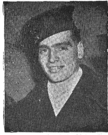
— "The Legionary"