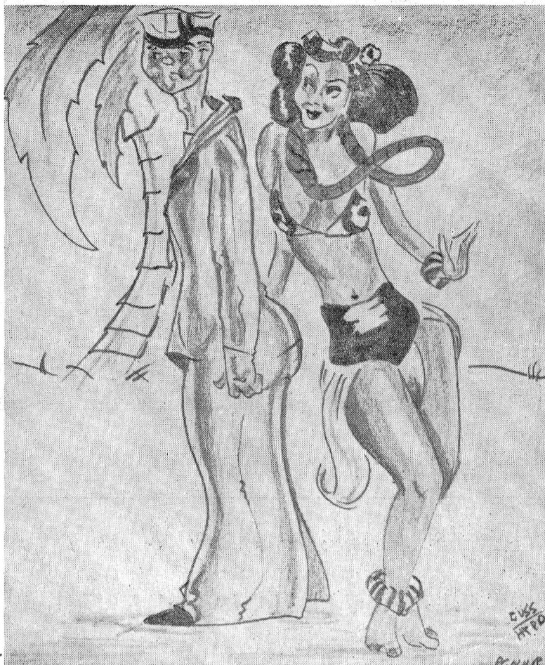
Just when she makes 'that' date you're Duty Watch, Fire Party, Compulsory Study, or have to read Night Flashing or a Buzzer Exercise.