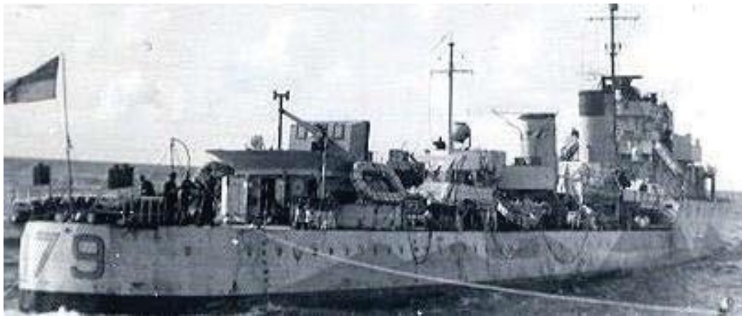
Destroyer Skeena circa 1942 as Senior Officer of C-3 with the Barber Pole Brigade symbol on after funnel.