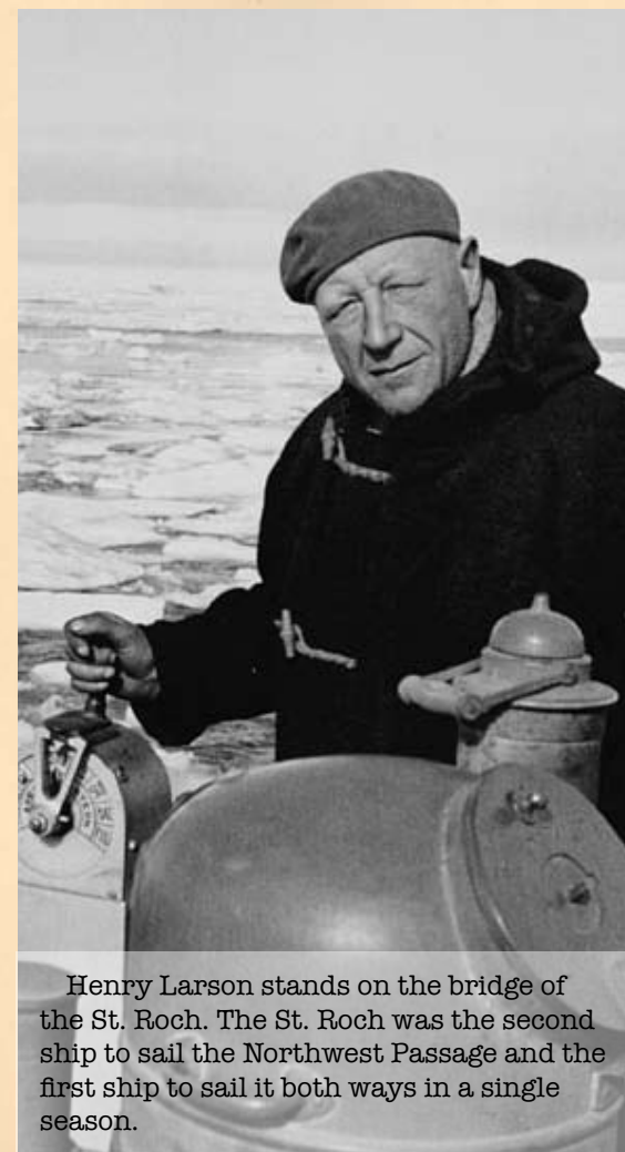
Henry Larson stands on the bridge of the St. Roch. The St. Roch was the second ship to sail the Northwest Passage and the first ship to sail it both ways in a single season.

As if to prove the point that ice conditions were never the same from one season to another, Larsen doubled back on the Northwest Passage in 1944, sailing east to west. Navigating St. Roch on a more northerly course, Larsen reached Vancouver in less than three months.